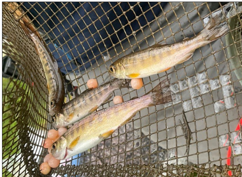
Figure 1.–Coho salmon caught at waypoint 759.