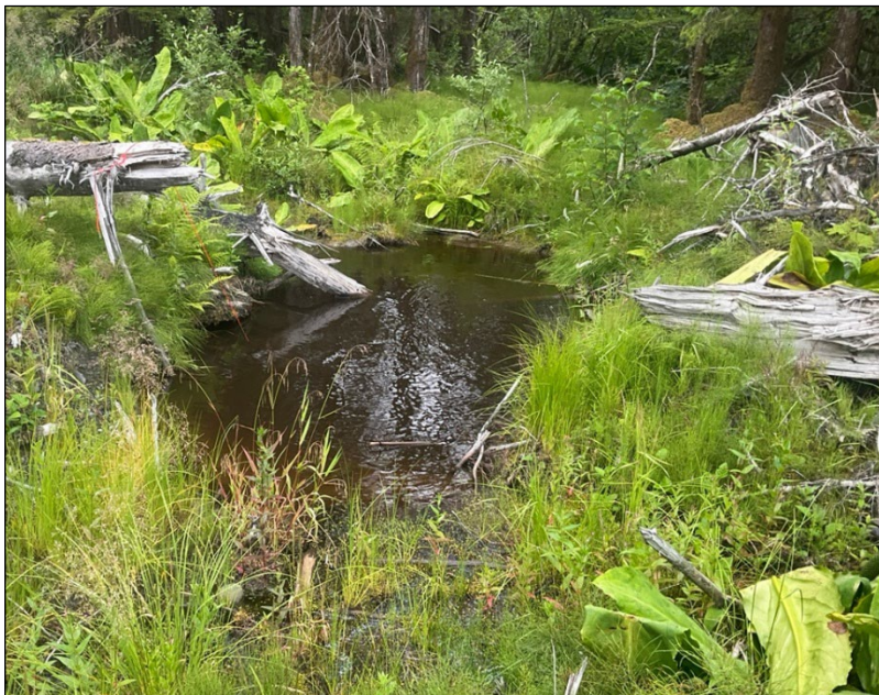
Figure 3.—Ponded water above the road at waypoint 759.