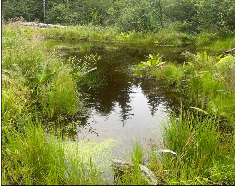
Figure 2.—Ponded water below the road at waypoint 759.